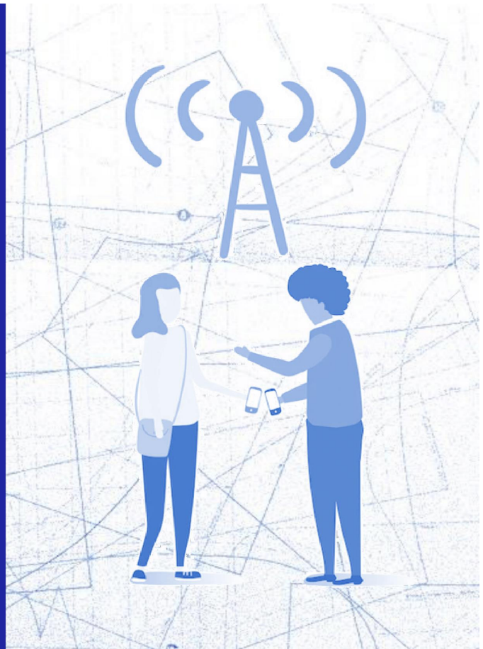
Figure 2: Second page of the CLUE-H brochure, presenting CLUE-H working groups

WG5 Exposure assessment: responsible for sharing methodology and experience in exposure assessment and application to evaluation of risks to health. Focus of the WG is on different novel sensors to measure RF-EMF exposure.